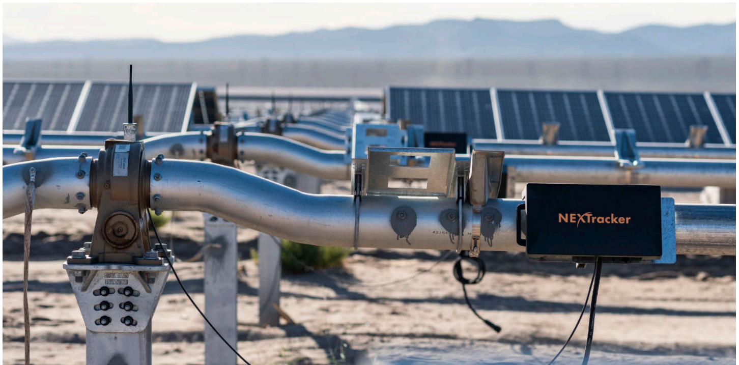
SRE at work constructing 251 MW in the Nevada desert.

Techren II is expected to supply 572 GWh of reliable solar power annually—equal to the average annual electrical usage of more than 48,000 Nevada households—and will contribute greatly to NV Energy's plan to double its renewable energy commitments by 2023 and diversify the state's energy mix. Representing an expansion in the utility's Green Energy Rider program for larger customers that want to replace their utility-delivered electricity with renewable generation, Techren II will have the additional benefit of offsetting nearly 323,000 tons of CO 2 annually, equivalent to "removing" 66,311 cars from the road. Beyond providing a boost in capital investment, the project also employed 250 local workers at peak construction with eight permanent jobs created and helps accelerate the booming market of the fourth-largest solar state in the country.